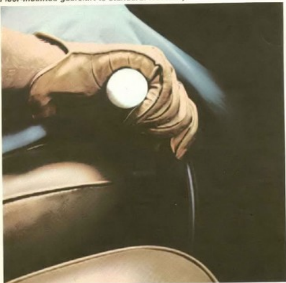
Floor-mounted gearshift is standard. Naturally