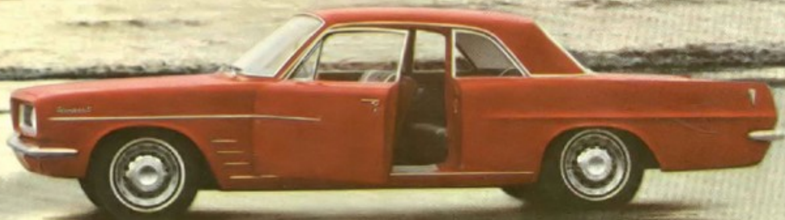
Sports Coupe—If this one were yours, we bet you wouldn't leave it sitting on a beach. It's too much fun to drive