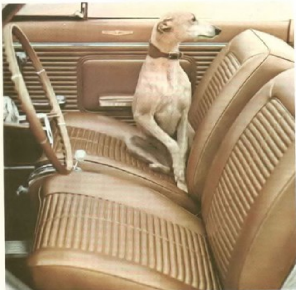
All-vinyl (except for rugs, of course) and five color schemes