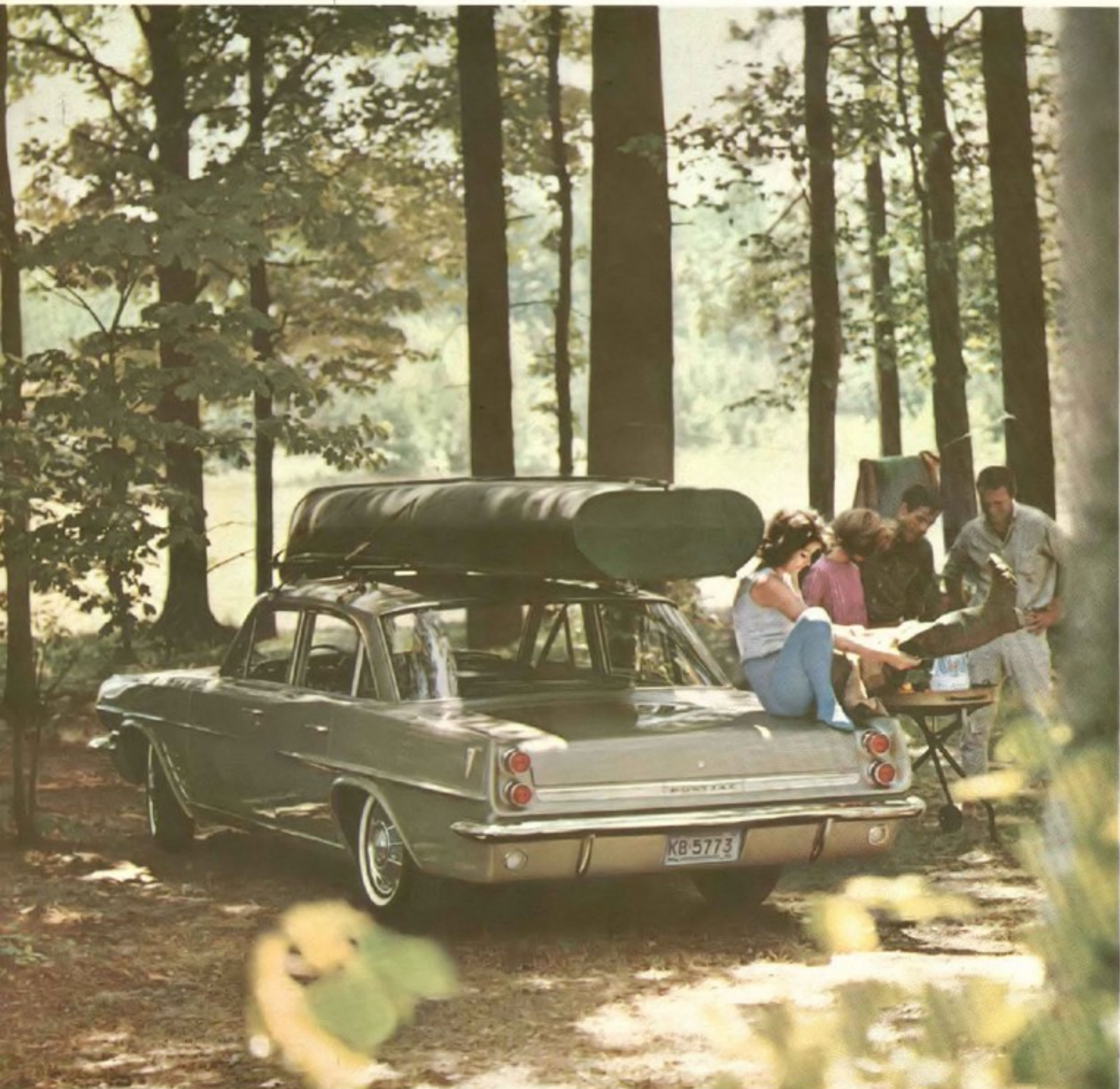
Some people swear by 4-Doors—and with a car like this, it's no wonder. Tempest 4-Door Sedan