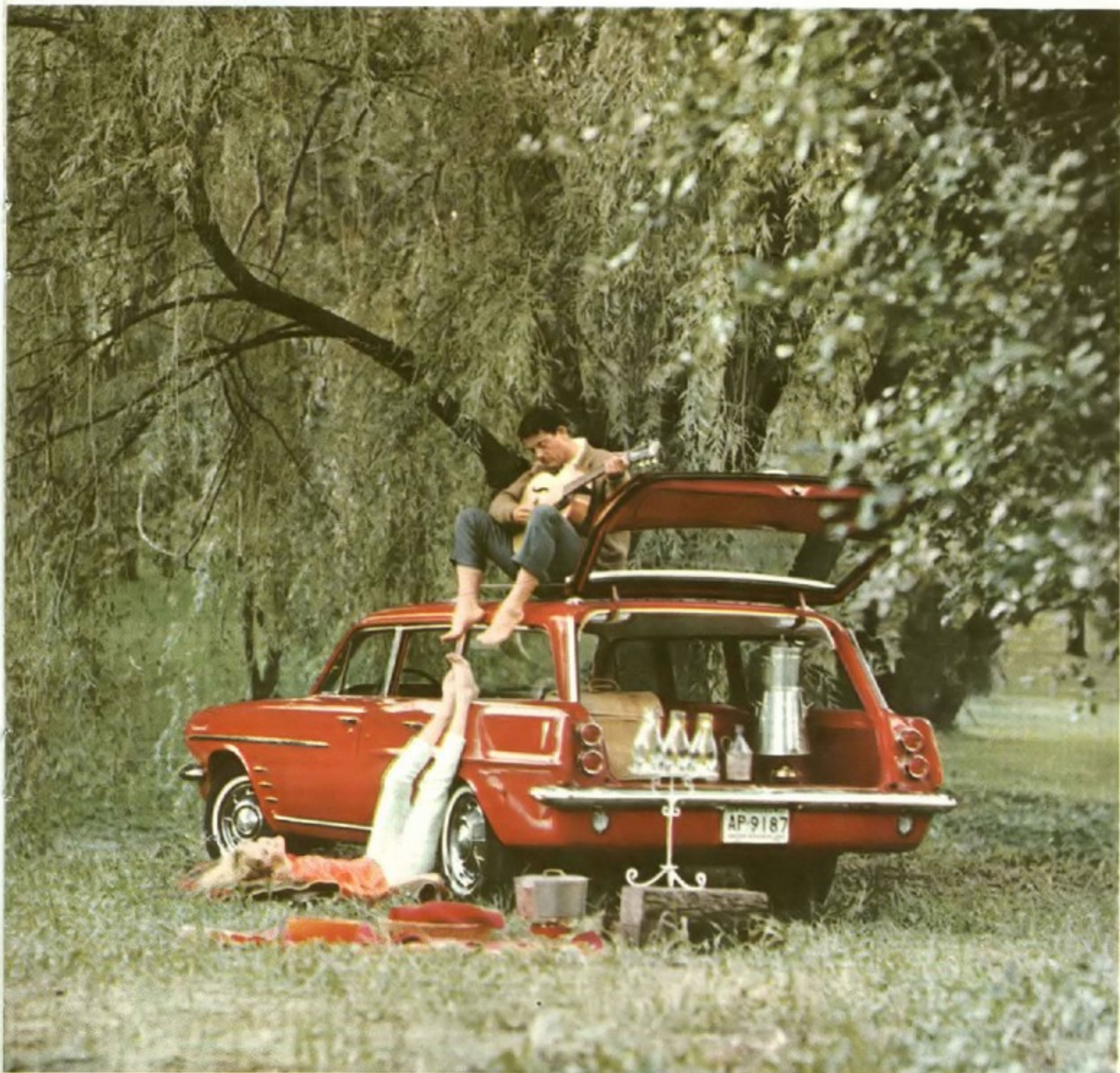
Surprise! This one can carry 72.2 cubic feet of stuff and still ride and handle beautifully. Safari Station Wagon