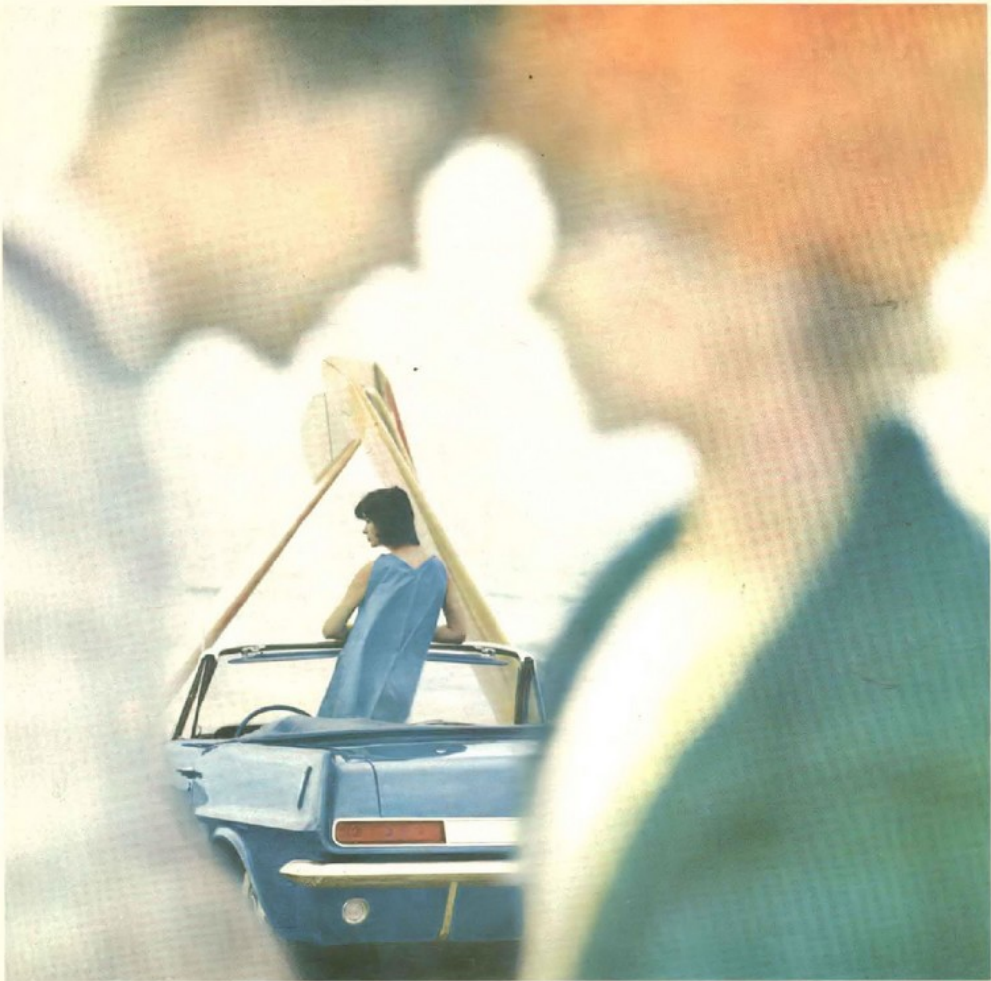
Litho in U.S.A. by Tempest-lovers. Isn't everybody?