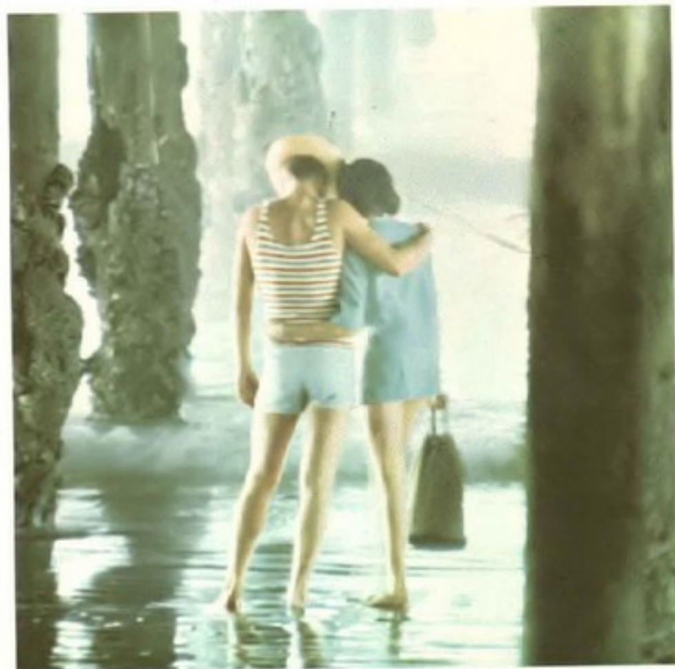
"Can't you stop talking about that Tempest for a minute?"