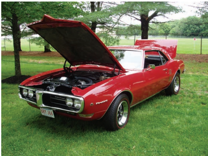
A nice first generation Firebird