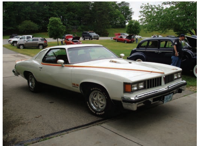
A 1977 Can Am braves the elements