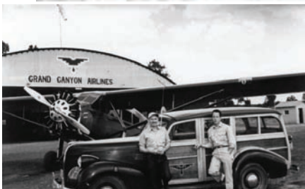
A close up of the woodie