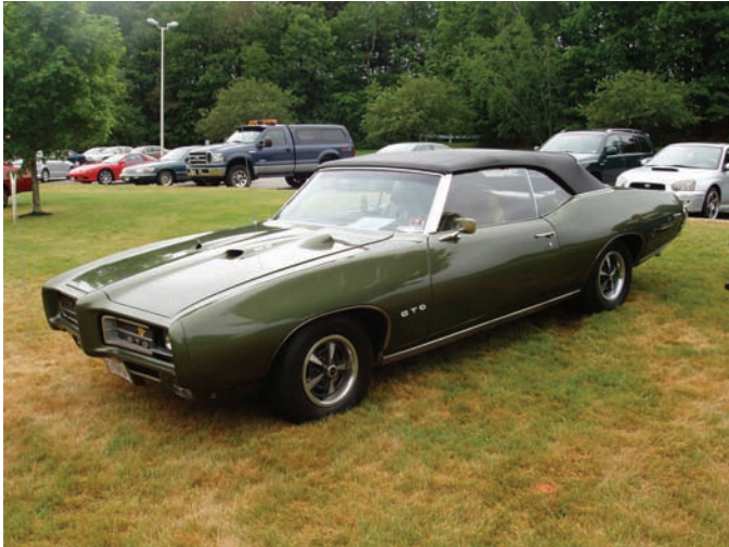
Dick Krafton's 1969 GTO