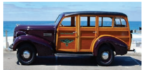
The freshly restored woodie