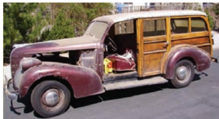
The woodie as found