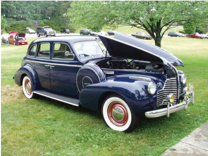
An early Buick sedan in Class A