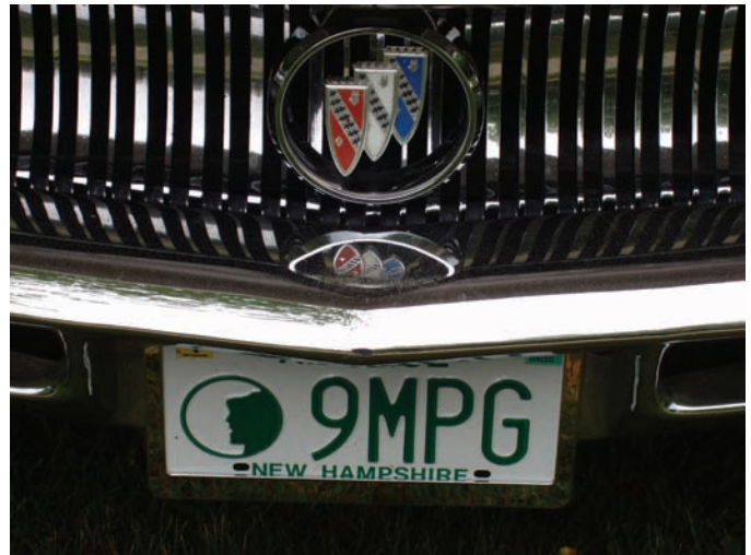
This plate pretty much says it all....