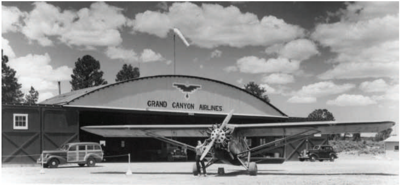
The 1939 Pontiac Woodie in its prime, ready to ferry passengers