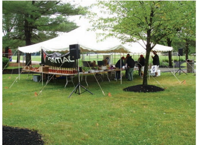
The registration tent - open for business!