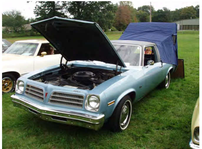
1976 Ventura with camper option