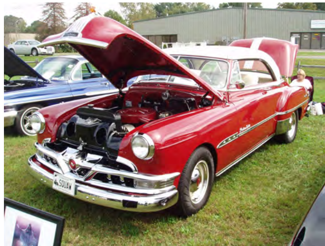
A modified 1952