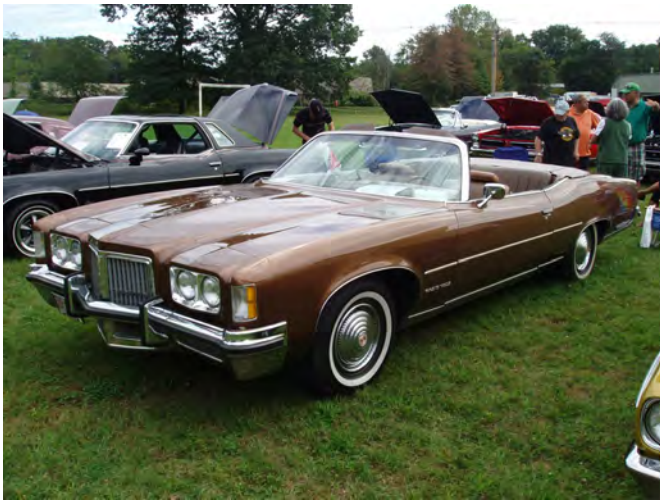
A 1970's Grandville convertible