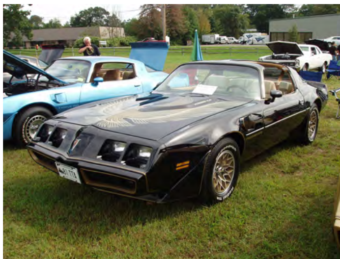
A 1979 Turbo Trans Am