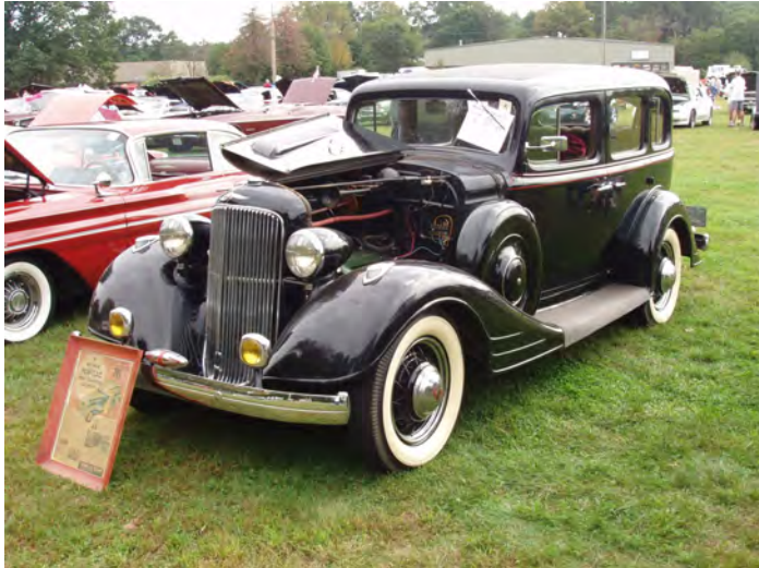
A 1934 sedan