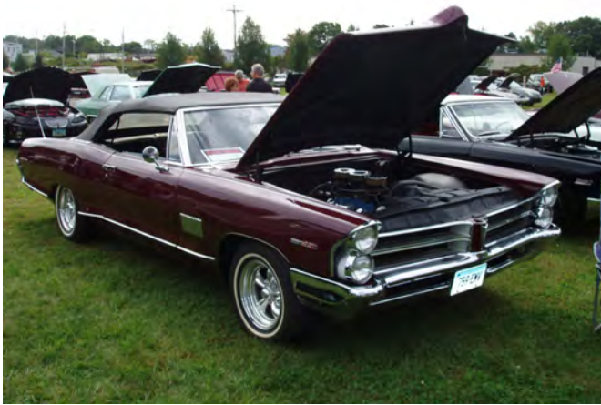
A mildly modified 2+2