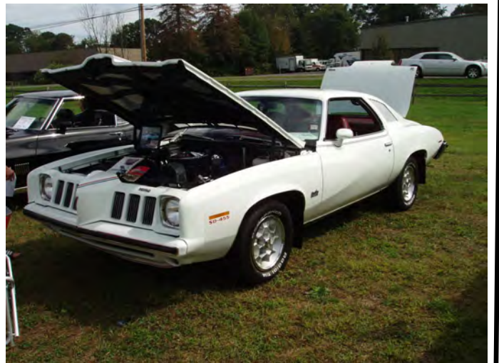
A 1970's Grand Am