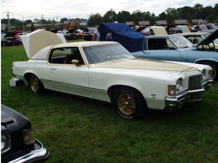
1972 Hurst SSJ Grand Prix