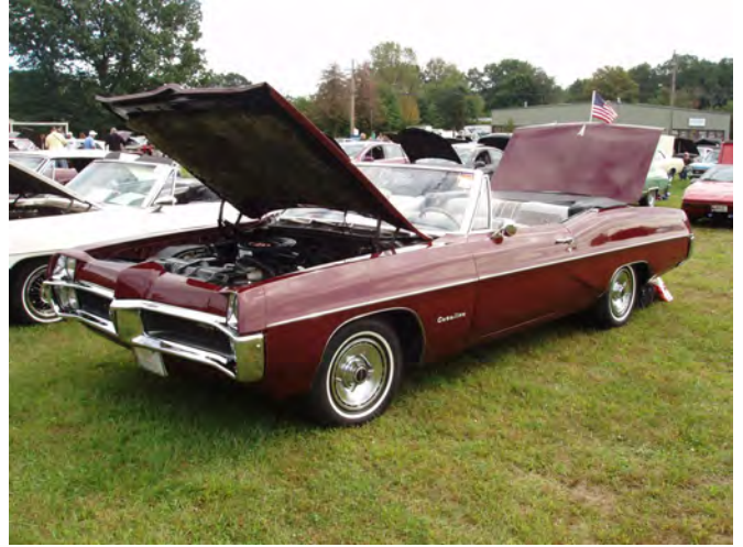
Nice Catalina convertible