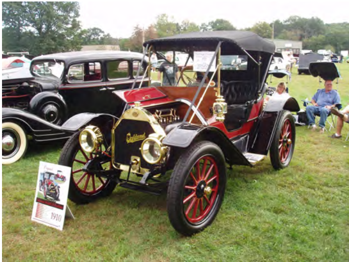
A beautiful 1910 Oakland