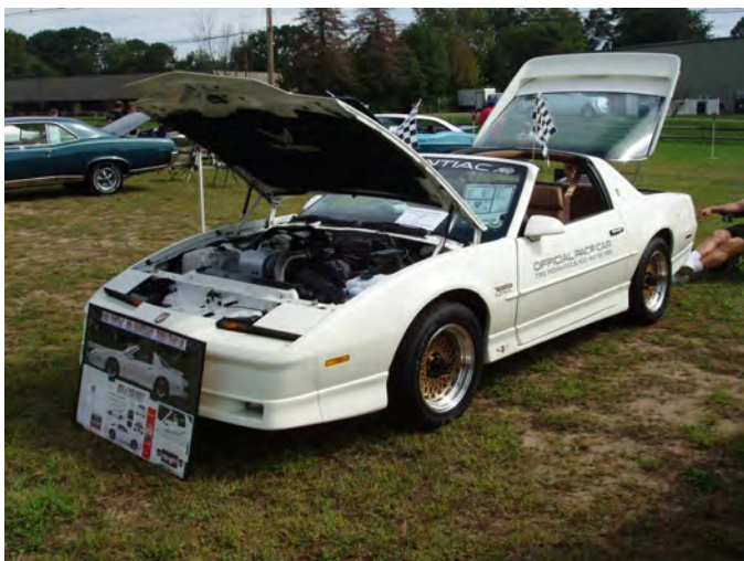
1989 Turbo Trans Am