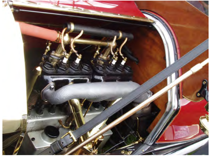
The Oakland's engine compartment